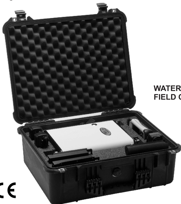
WATERTIGHT FIELD CASE